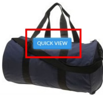
Joust Duffle Bag